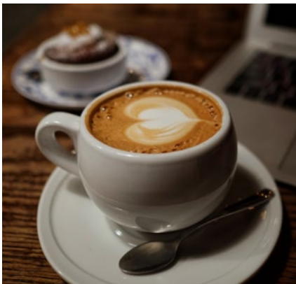
Lock Stock Coffee

At Lock Stock, espresso is pulled with care, savoury biscuits are baked fresh and heated to order, and English muffins are fried daily for a variety of sandwiches, making them a necessary stop when in the downtown neighbourhood.